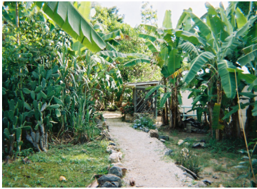
A pathway through the banana trees