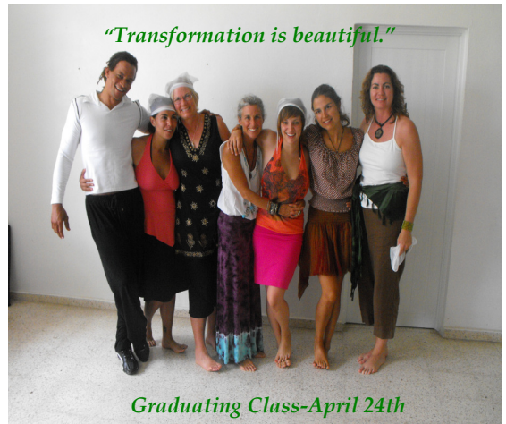
Graduating Class-April 24th